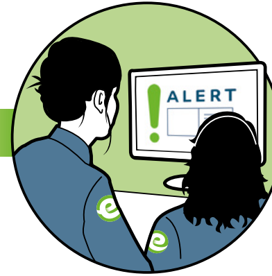
3 The incident is examined by a Behaviour Analyst