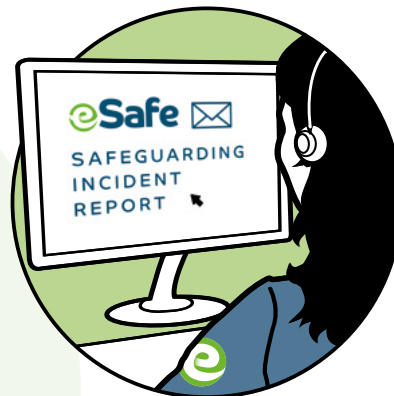
7 Category B incidents are reported that day by email Category C incidents are detailed in a weekly round-up report, by email