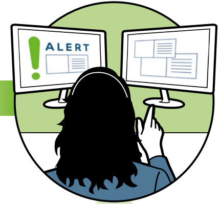
4 They determine if it's genuine or not