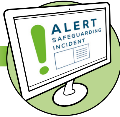
2 An alert is triggered