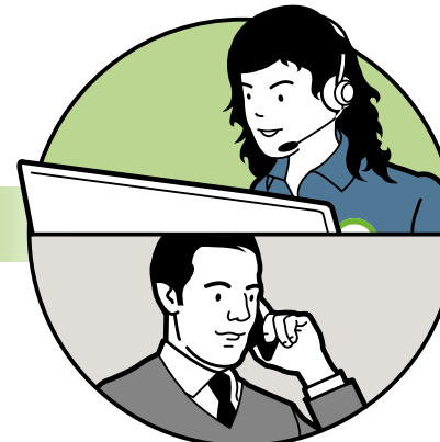
6 Category A incidents are reported immediately by telephone, and within a report that is emailed the same day